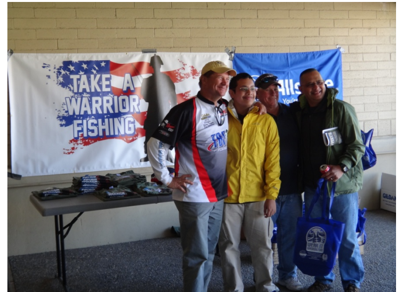
Multiple Lake sites are hosting events with support from the community, friends groups and corporations