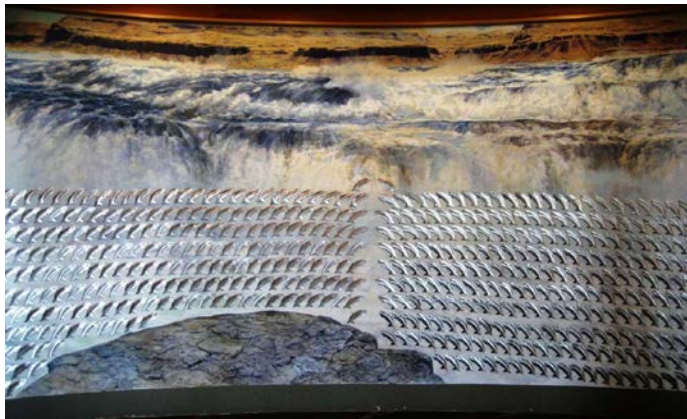
Donor board at the Tamástslíkt Cultural Institute, Pendleton, Oregon