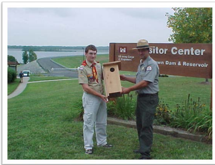
Donation of nesting boxes from an Eagle Scout