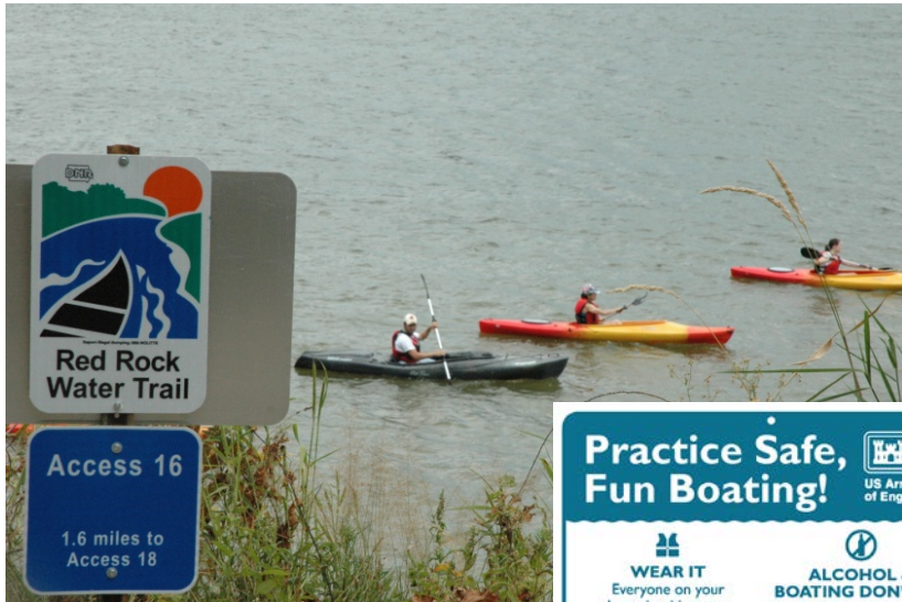
Lake Red Rock on the Des Moines River